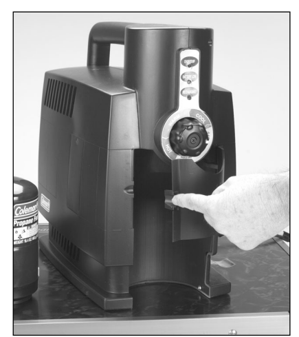
Open the Propane Access Door.